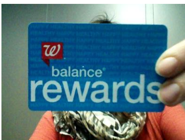
Not a Valid Photo ID