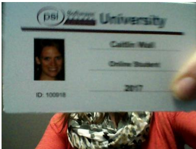
Blurry Photo with Illegible Name