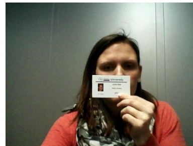
Too Far Away To View