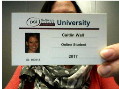
Legible Image and Name