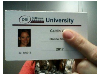
Covering The Name